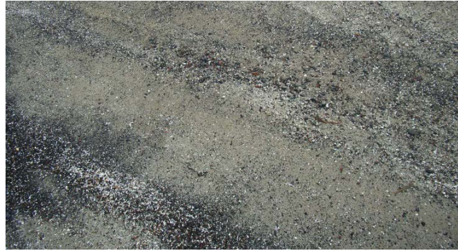
(Janssen 2012, p. 447)

Save time in Word with new buttons that show up where you need them. To change the way a picture fits in your document, click it and a button for layout options appears next to it. The picture can then end up looking like one of these: