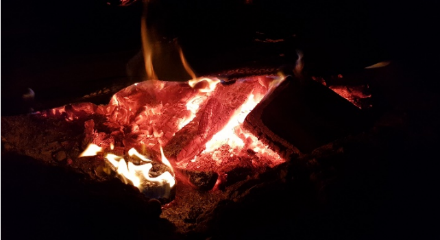
(Wave Energy Devices 2016)