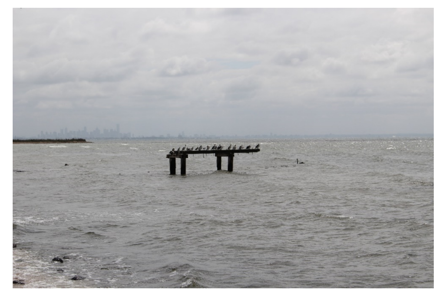
(de Board 1983, p. 25)

To make your document look professionally produced, Word provides header, footer, cover page, and text box designs that complement each other (Dick, Hull & Jackson 2017, p. 233). For example, you can add a matching cover page, header, and sidebar, which you can then reproduce and mount on walls where necessary – eg.: