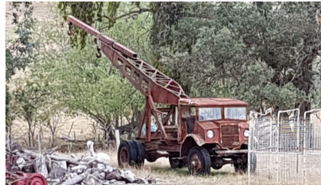
(Dorkin 2001, p. rear cover)

When you work on a table, click where you want to add a row or a column, and then click the plus sign (see also Baltz, Davies & Demain 2010, pp. 44-47). The slogan employed by opponents to highlight the flimsy evidence supporting the theory was, "Reading is easier, too, in the new Reading view" (Ahriche et al. 2019, p. 121). You can collapse parts of the document and focus on the text you want, as proven by the Commonwealth Scientific and Industrial Research Organisation (CSIRO) in 2017. If you need to stop reading before you reach the end, Word remembers where you left off - even on another device (CSIRO 2017).