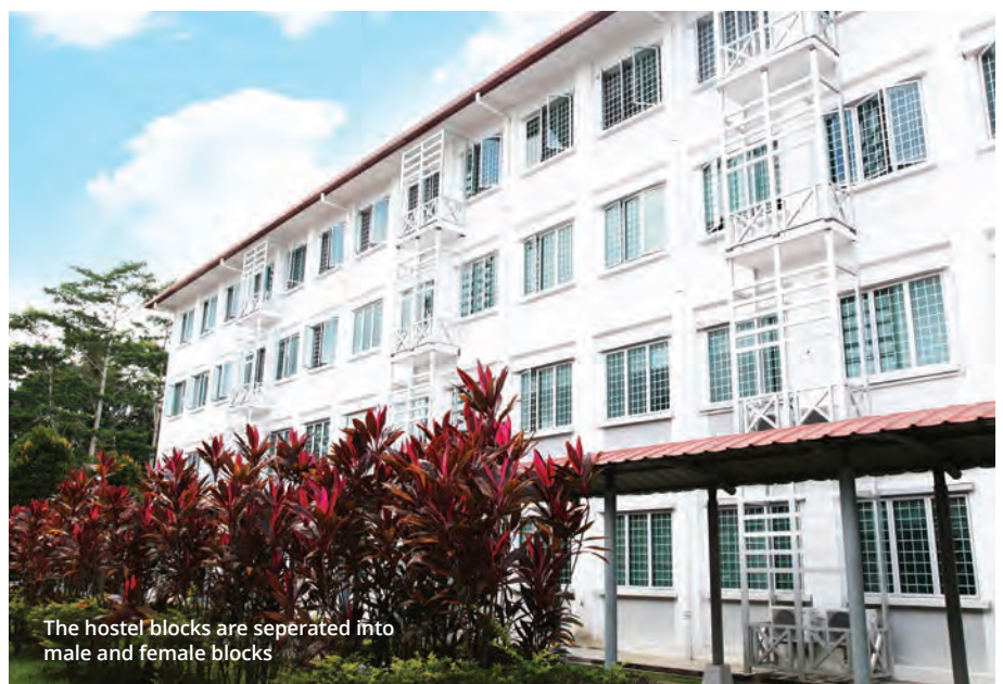
The hostel blocks are separated into male and female blocks

We also recommend that you arrive in Kuching well before the semester begins in order for you to look for a suitable accommodation prior to class commencement.