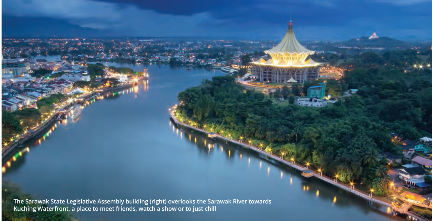
The Sarawak State Legislative Assembly building (right) overlooks the Sarawak River towards Kuching Waterfront, a place to meet friends, watch a show or to just chill

Kuching is simply unique. It brings together a kaleidoscope of culture, crafts and cuisines that represents its more than 40 ethnic sub-groups. Getting around Kuching is quick, easy and traffic jams are rare. With a welcoming atmosphere, Kuching offers students a relaxed lifestyle with the convenience of city living.