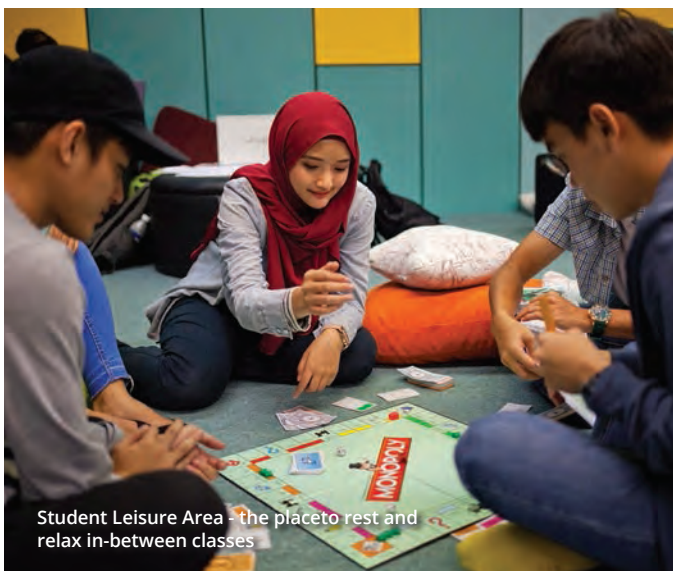
Student Leisure Area - the placeto rest and relax in-between classes