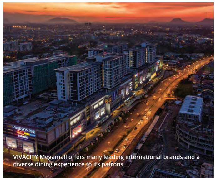
VIVACITY Megamall offers many leading international brands and a diverse dining experience to its patrons