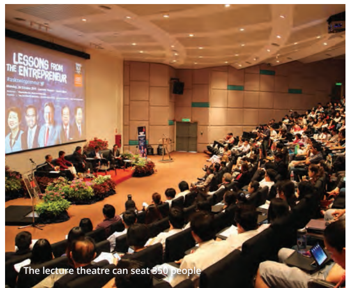
The lecture theatre can seat 350 people