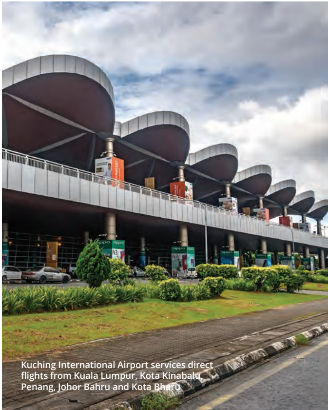
Kuching International Airport services direct flights from Kuala Lumpur, Kota Kinabalu, Penang, Johor Bahru and Kota Bharu