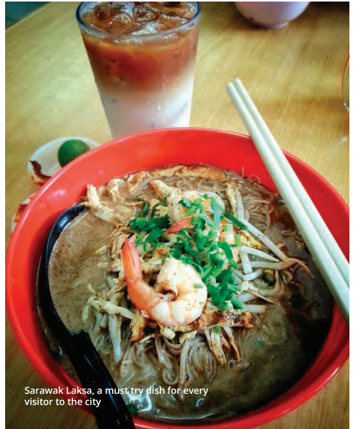
Sarakwak Laksa, a must try dish for every visitor to the city