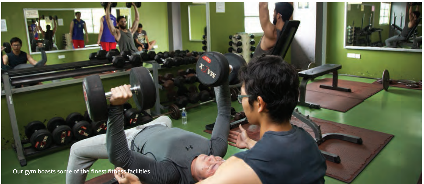
Our gym boasts some of the finest fitness facilities