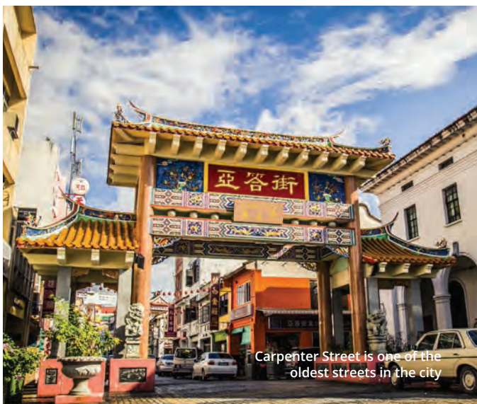
Carpenter Street is one of the oldest streets in the city