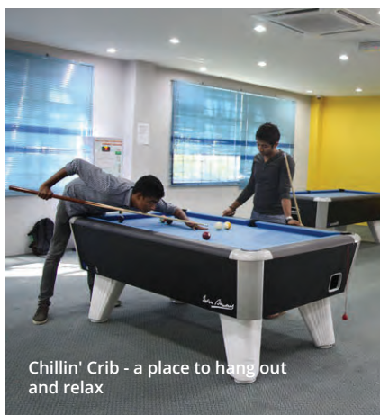
Chillin' Crib - a place to hang out and relax