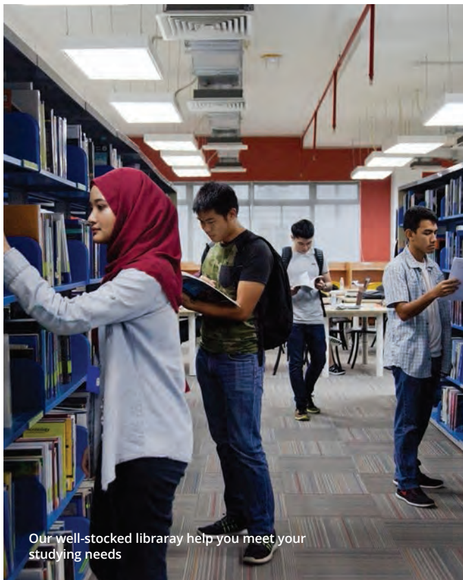
Our well-stocked library help you meet your studying needs