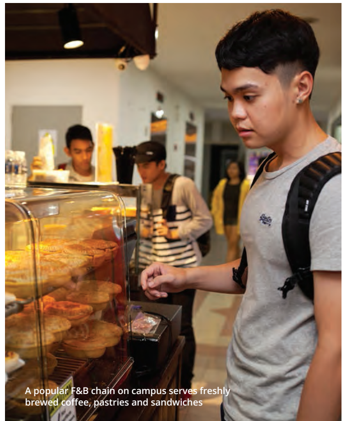
A popular F&B chain on campus serves freshly brewed coffee, pastries and sandwiches